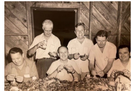
1955 SBS Seafood Party

Please don't let me hear you call them crayfish... it's like nails on a chalkboard here in BR. CRAWFISH is the politically correct term and all students are invited to enjoy some tomorrow night starting at 6:30PM at the LSU Mini Barn (91 Ag Center Dr, Baton Rouge, LA 70803). For those that view them as